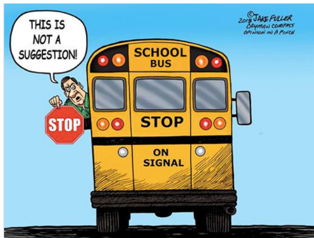
Remember, it is easier to explain to your boss why you are late to work than to explain to a parent why their child will not be coming home tonight.

I hope everyone enjoys the last few weeks of summer and I wish everyone a great fall. Happy Halloween and Thanksgiving!!!